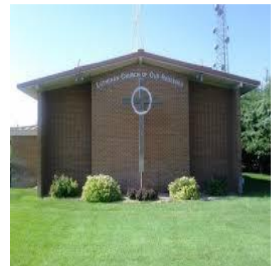
Lutheran Church of Our Redeemer